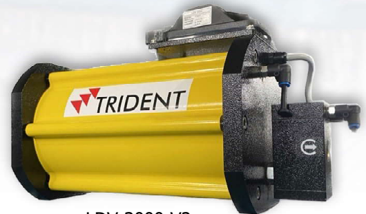
LDV 3000 V2